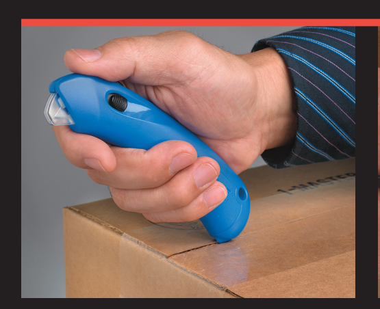
Built-in tape splitter.

Keep hands on the opposite side of the box top you are cutting.