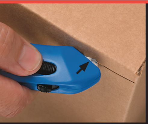
Push button forward to expose the blade.